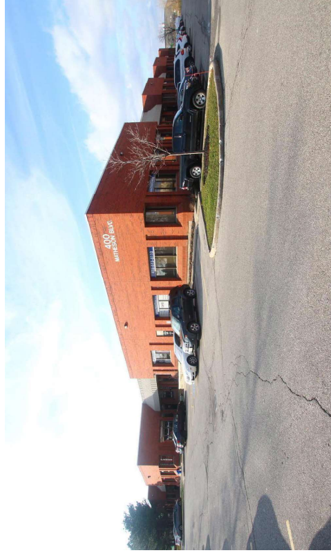
400-450 MATHESON BOULEVARD EAST, MISSISSAUGA | ON